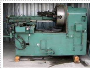
Vertical turning lathe TOS SKJ 8 E NC , 900mm