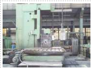
Boring machine Russian F1 x-y-z:3300x2000x1250mm