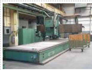
CNC Portal milling machine FOREST-LINE V1.2000.B. x-y-z:6300x2000x500mm