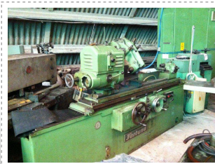
Cylindrical grinder Fortuna ESU 350/1000