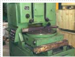
Gear shaper Komsomolec 5140 dia:500mm,module 8