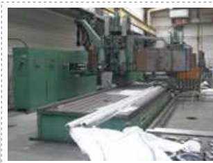
CNC Portal milling machine FOREST-LINE V2.1600.B. x-y-z:5000x1600x500mm