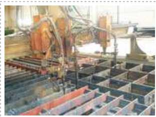
CNC cutting machines Varstroj Pantograph 10000x2500mm