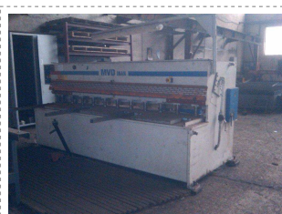
Hydraulic shears MVD INAN 3000mm x 6mm,YOM:2005