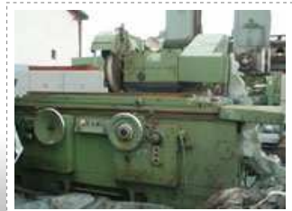
Cylindrical grinder Kikinda dia:300mm,b.cent.:700mm