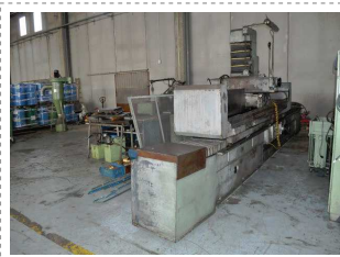
Surface grinder Alpa magnet.chuck:3000x450mm