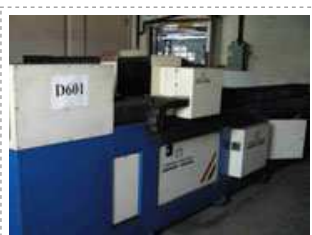
Laser Rofin RS1700SM 1750Watts,3000x2000mm