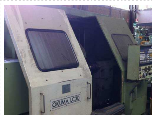
CNC Lathe OKUMA 450x750mm